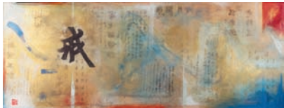
Yangtze